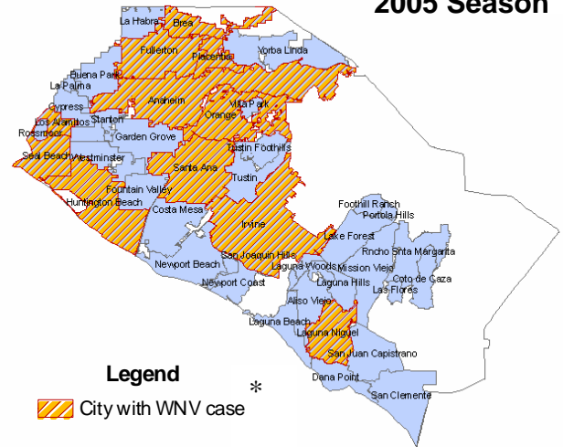
West Nile Virus Cases 2005 by Week of Onset