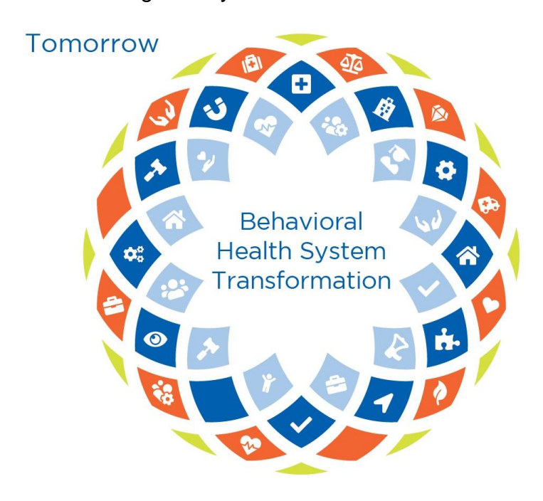
Figure 2. Depiction of the future behavioral health system, operating interdependently.

Orange County will then use the learnings from these discussions to identify ways to overcome system fragmentation and organize service delivery across sectors (see Figure 2). To achieve this end goal, transformational activities will need to occur at two levels simultaneously: 1) aligning legal, fiscal and regulatory requirements and 2) aligning local organizations in a unified navigation system.