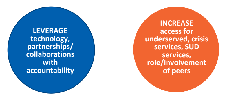
Figure 3. Orange County stakeholders have identified the need to increase access to services, as well as leverage technology and partnerships with accountability.

In addition, many diverse communities (i.e., Veterans, LBGTQ, deaf and hard of hearing, monolingual communities, ethnic communities, etc.) remain unserved or underserved because the consumer must engage with a provider based on their approved insurance network rather than on their cultural needs and preferences. By continuing to prioritize the approved payer source over person-centered needs, many traditionally unserved and underserved communities remain marginalized from behavioral health services (see Figure 3).