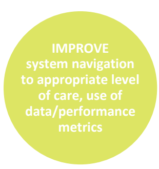
Figure 4. Orange County stakeholders have identified the need to improve system navigation.

Orange County will seek to address these obstacles by partnering with local agencies and organizations to consolidate and integrate their disparate directories into a single source. The proposed electronic directory will give providers direct access for updating their program information online, as often as needed, so that the directory remains current. An optional, electronic Social Determinants Survey will also be developed so that individuals who are unsure of how to begin a search independently can receive computer-assisted guidance towards resources that are filtered and prioritized based on their reported needs.