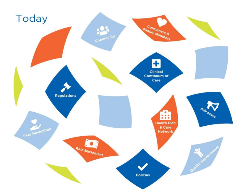
Figure 1. Depiction of the existing fragmented behavioral health system, operating independently.

Orange County residents have expressed concern that individuals seeking behavioral health care are limited in their access to services based on their insurance status (i.e., insured, uninsured), insurance type (i.e., MediCal, commercial, etc.); knowledge of what their health plan offers; and/or comfort with engaging in services that are available to them through their health plan. Rarely do consumers have the freedom to access services based on clinical and cultural needs if those services exist outside of their provider network. Yet when one considers the breadth and depth of behavioral health services available across the public, private and non-profit sectors, it becomes apparent that these limits to access are, in large part, an outgrowth of behavioral health systems that operate independently from one another and are organized within the constraints of their funding-based regulatory requirements (see Figure 1). This lack of formal collaboration across sectors has resulted in fragmentation of service delivery that impacts individuals' access to and engagement in appropriate care.