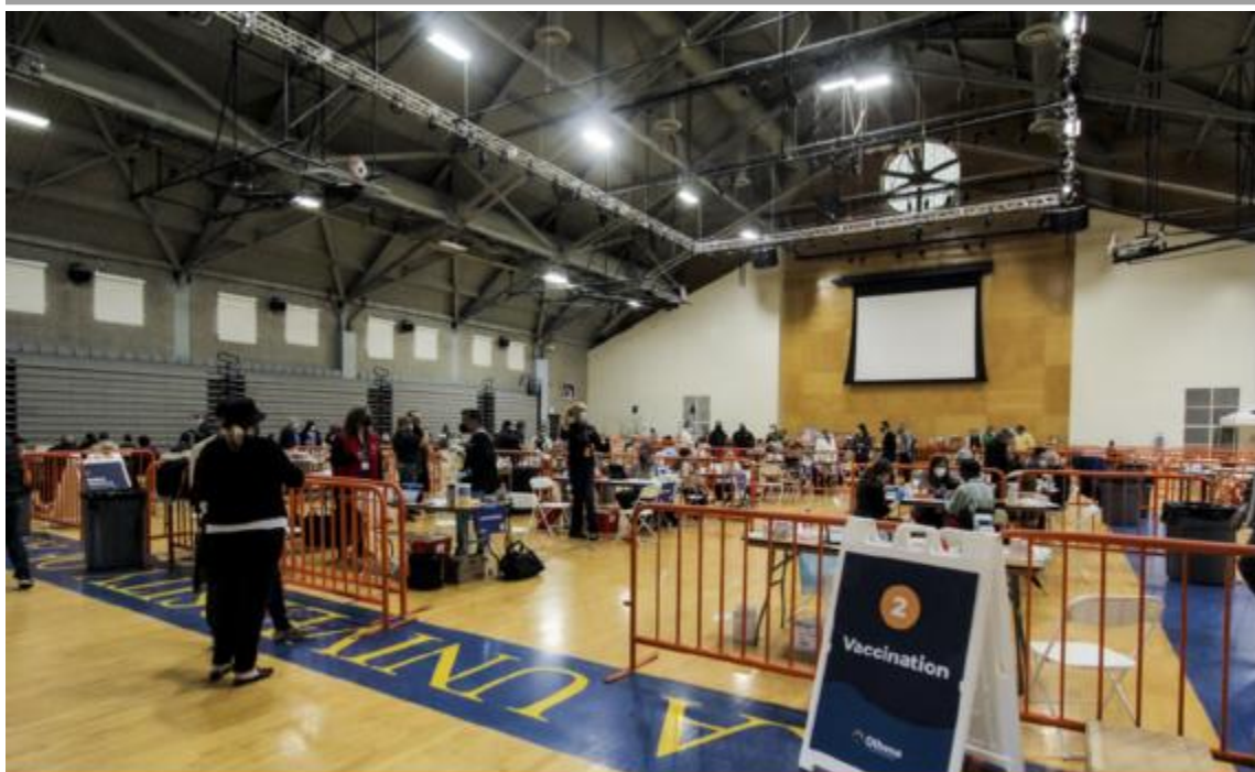
Pictured: Vaccinations are underway at Soka University, OC's newest Super POD site.