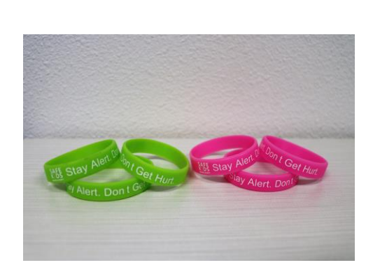
"Stay Alert. Don't Get Hurt." Silicone Wristbands