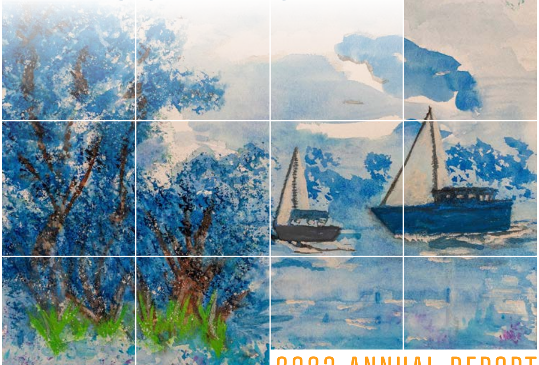
The Bay by Pamela Blaser