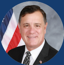
3rd District Supervisor