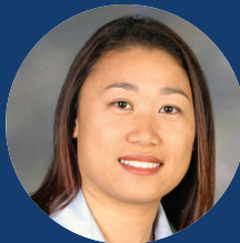
1st District Supervisor