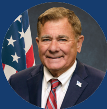
4th District Supervisor