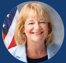
5th District Supervisor