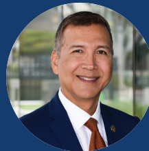
2nd District Supervisor